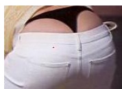
The 'professional image' of a teacher, unaware of her message.

Where: Queanbeyan Kangaroo Rugby League Football Club Stuart Street Queanbeyan.